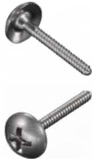
highly enlarged illustrations